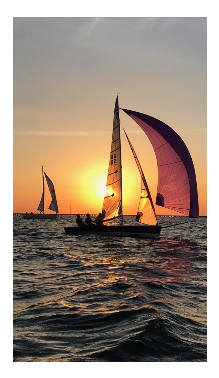
STRAIGHTJACKET AND VIPER