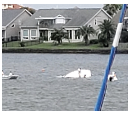
Capsize and Recovery