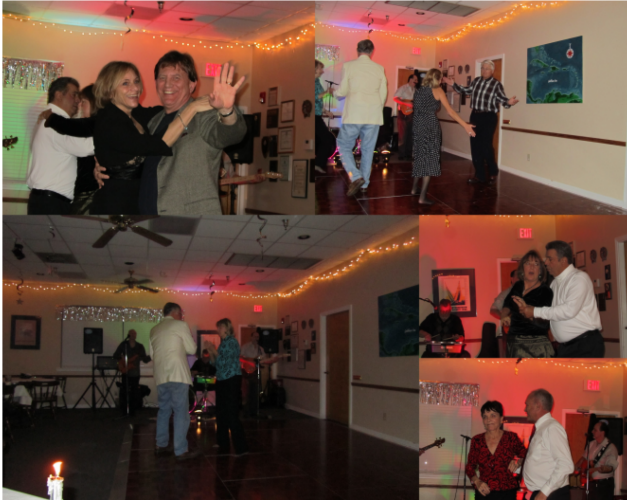
These are "Dancers".