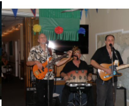
The Arrivals Kept Us Rocking into the Night