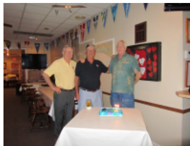
No idea how many candles we need August 2011 Birthday Boy's

Choice of Filet, Rib-Eye or Tuna Filet Mushroom Sauce Baked Potato/ with trimmings Salad, Bread and Dessert