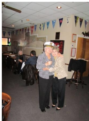
Yes we are cute.