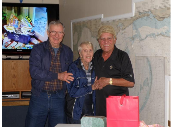
Wear this wig with honor.