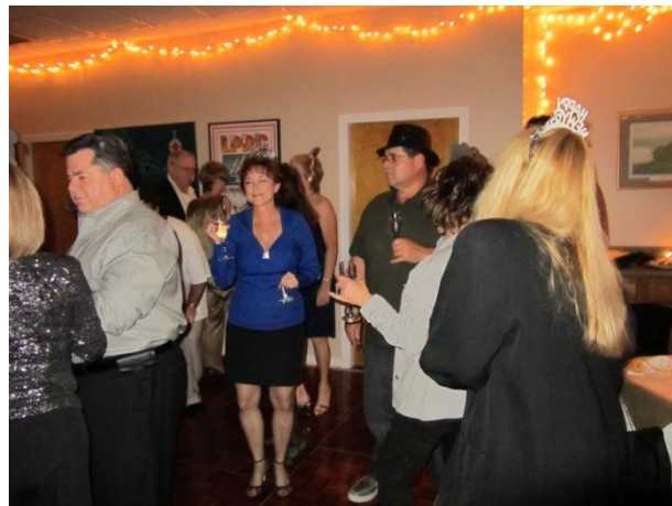
Al – it looks like your whole group is on the floor having fun....Happy New Year and Happy Birthday