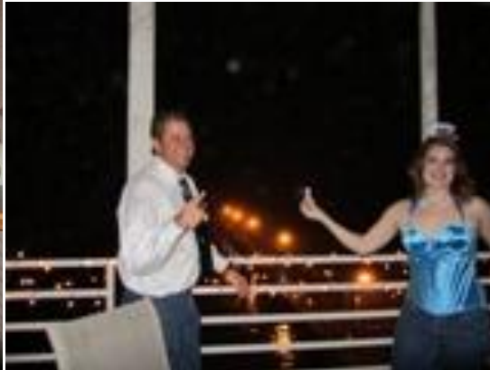
Through it now!!!