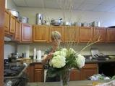
JB arranges flowers for party.