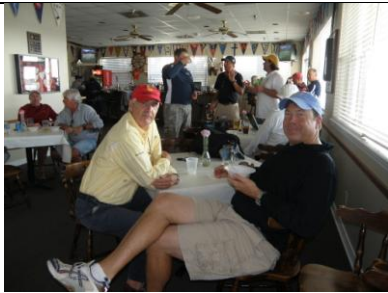
Waiting for the Race Results