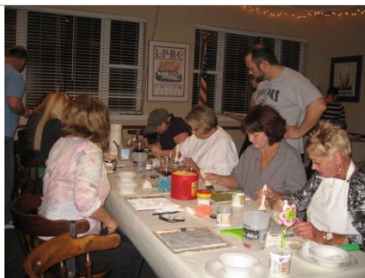
Art night at TYC