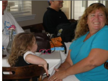
Dodie and granddaughter listen to race results