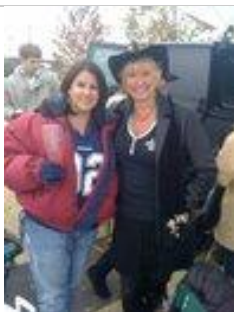
May the Best Team Win