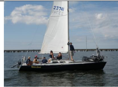
"Wild Bunch" on "Wild Card"