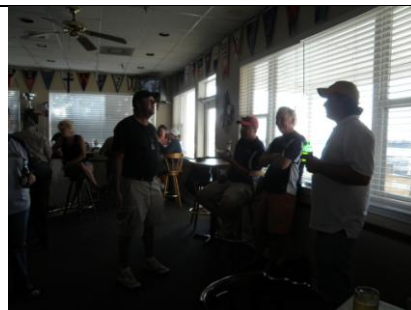
Just a friendly conversation about the race