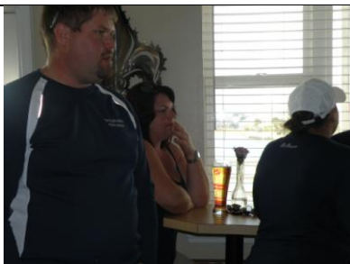
Wild Card Crew waiting for the Race Results.....