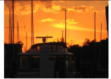
Wooden Boat Festival Sunset