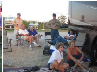
Everyone is enjoying the LSU game.