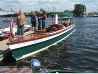
Steam drive wooden boat