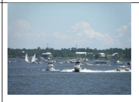
Don't get in the way when the race is over!!!!!!!!!!!!