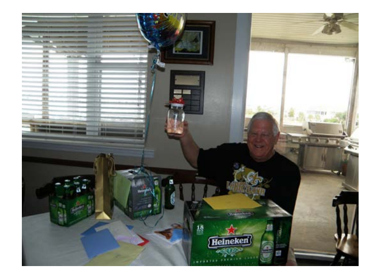
Nothing like a little Moon-Shine to go with my Heineken.