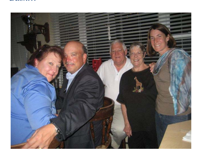
Actually everyone was having a great time.