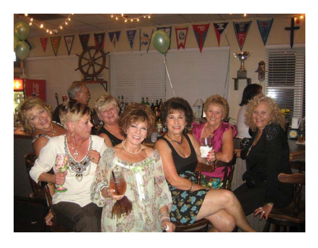
Looks like all of the ladies were enjoying your Triple Bash!!!