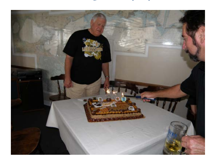
Lee are those candles loaded?