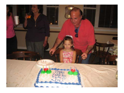
JD you know you are not supposed to give children cake this late, she will be up all night – Isn't she a beauty.