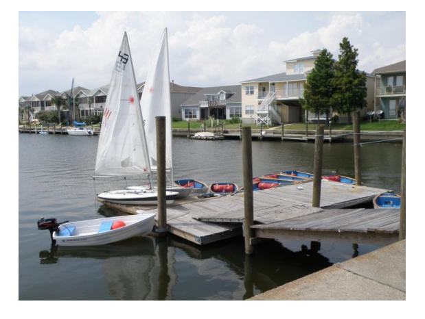
Day is Over.....