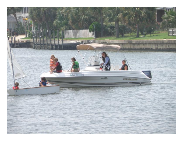
There's always an instructor in a power boat to guide the Junior's along the way.