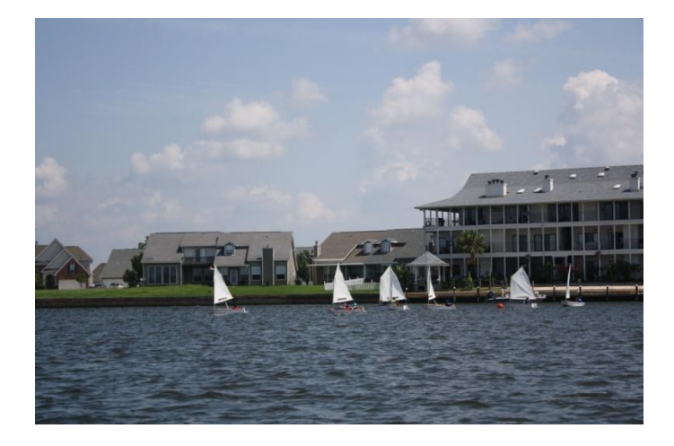
They are learning how to maneuver around the mark.