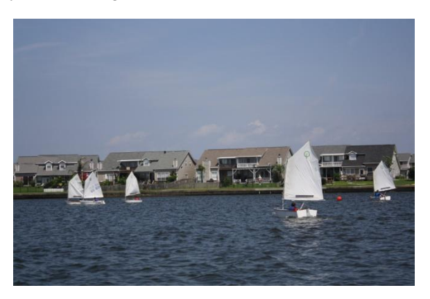
What a beautiful sight for the resident's on Marina drive.