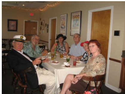
“Did we get enough to eat”