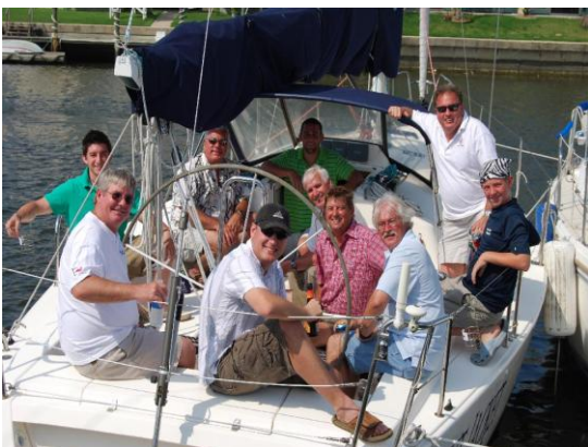
Straight Jacket docked after "May Day Regatta" Getting ready for "Blessing of the Fleet"