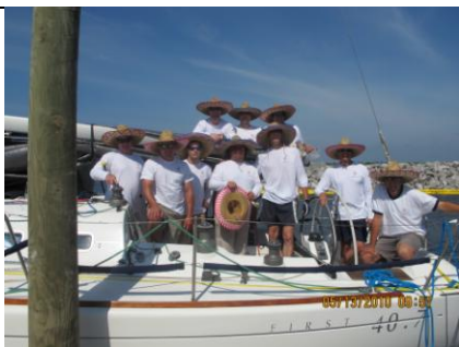
shot prior to the start of the race.

Sapphire finished third in the racing division, only 14 minutes behind second place, Big Booty. On the island, the Sapphire was the biggest crew by far becoming well known by their uniforms and their spirit.