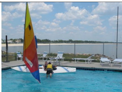
The Class going over the "Scoop" method of capsizing recovery.