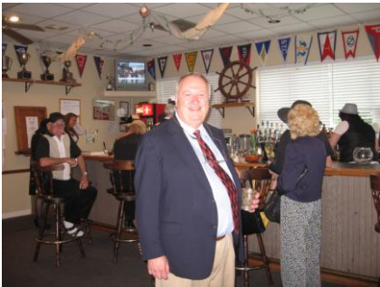
Bradford “Let the Party Begin”