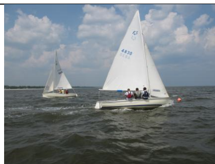
The class going through the on the water drills