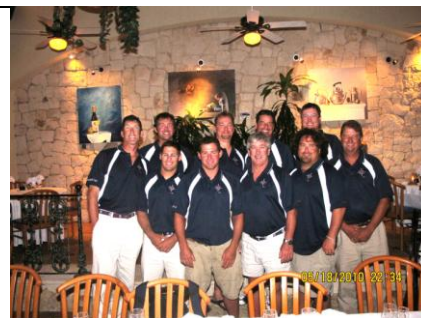
Crew picture at dinner.