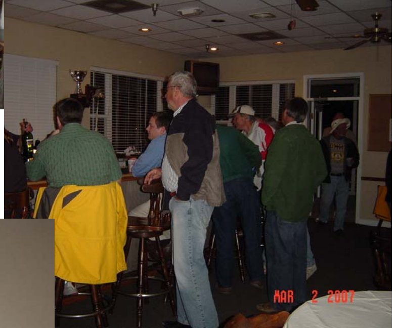
Above: TYC members & Guests