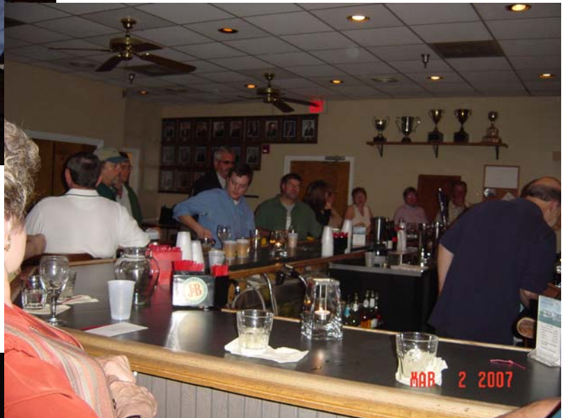
Right: TYC Members & Guests