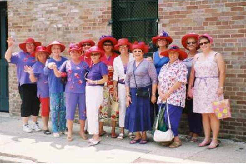
An outing to the Aquarium in New Orleans.

TYC ladies who are members of the Red Hat group "W.W.O.T." (Wonderful Women of Tammany) has been busy with monthly outings.