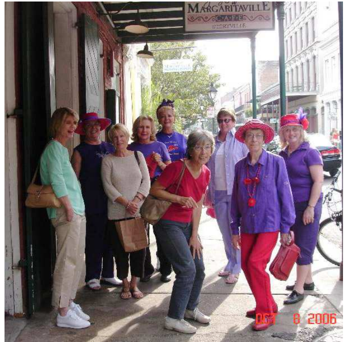
A Secret Garden Tour in the French Quarter, followed by a late lunch at Margaritaville.